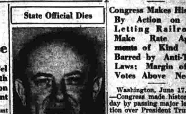
State Official Dies

Housewares 53 Piece Dinnerware Set, Reg. $27.95, Now $16.95